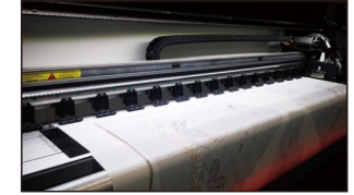
Front Adjustable Roller