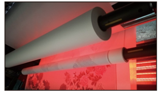
Heavy-Duty Device System