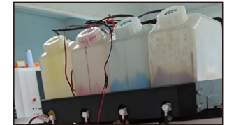
Bulk Ink System