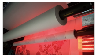
Heavy-Duty Device System