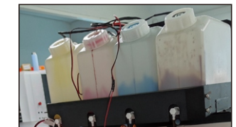
Bulk Ink System