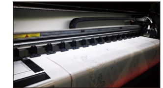
Front Adjustable Roller